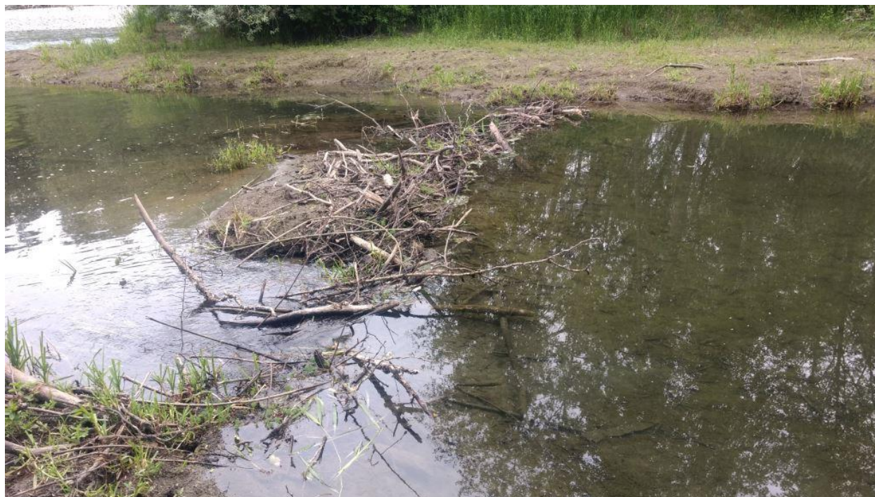
Figure 3: Photograph of Beaver Dam 1 near the confluence of Somenos Creek and the Cowichan River. Water can be seen flowing over the spillway at the eastern portion of the dam towards the bottom left of the picture. The Cowichan River can be seen at the upper left corner.