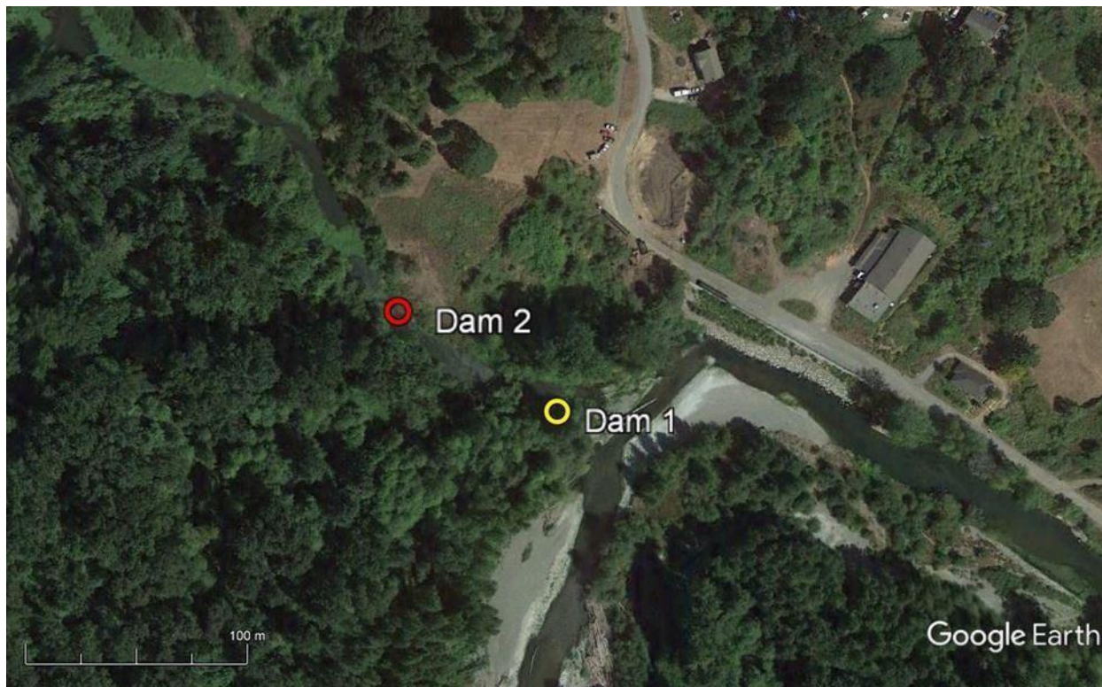
Figure 2: Lower Somenos Creek at the confluence with the Cowichan River.