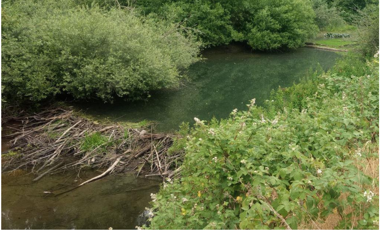
Figure 4: Photograph of Beaver Dam 2 100m above the confluence of Somenos Creek and the Cowichan River. Water is flowing over the unseen spillway at the eastern shore of the creek. A mat of Parrot's Feather can be seen accumulating as the light green material on the upstream side of the dam near its center.